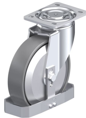
Corresponding swivel caster LH-PO 200K-ELS-FA-FS