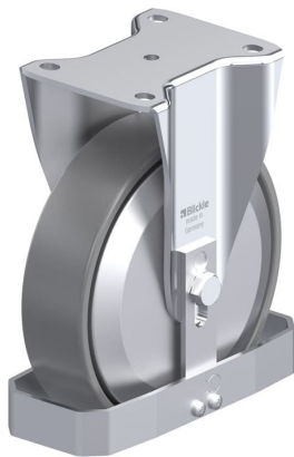
Corresponding rigid caster BH-PO 200K-ELS-FA-FS