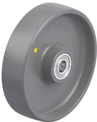
Wheel used PO 200/20K-ELS