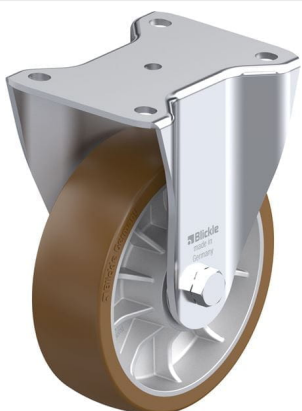
Corresponding rigid caster BH-ALB 162K