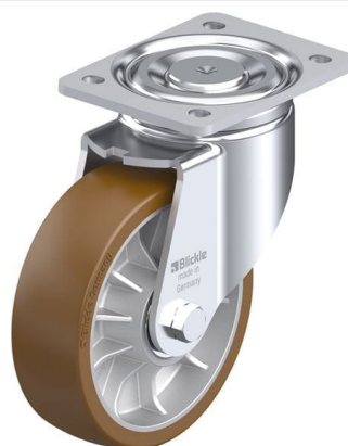
Corresponding swivel caster LH-ALB 162K