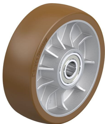
Wheel used ALB 162/20K