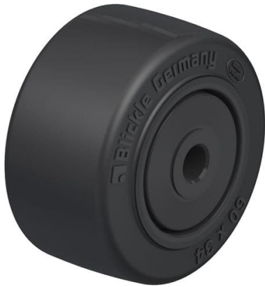
Wheel used POEV 60/8KF