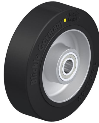
Wheel used ALEV 125/15K-EL