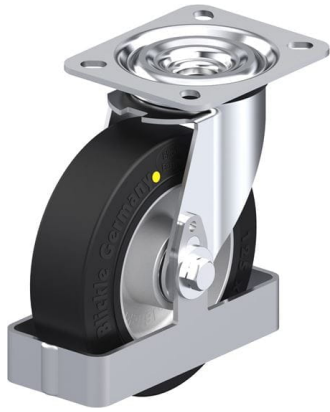
Corresponding swivel caster L-ALEV 125K-EL-FS