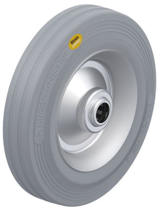
Wheel used RD 202/20R-VLI