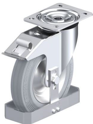
Corresponding standard locking L-RD 202R-FI-VLI-FS