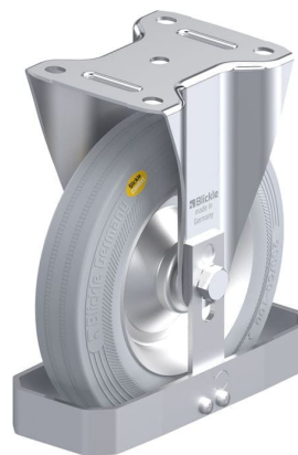
Corresponding rigid caster B-RD 202R-VLI-FS