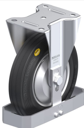
Corresponding rigid caster B-RD 202R-FA-FS