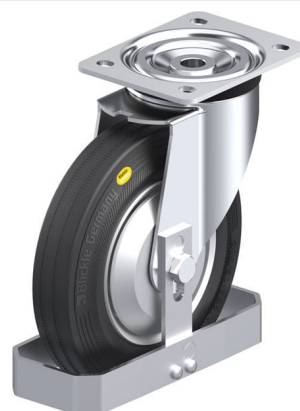
Corresponding swivel caster L-RD 202R-FA-FS