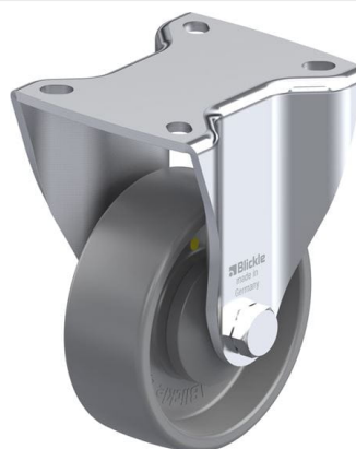
Corresponding rigid caster BH-PO 100KA-1-ELS