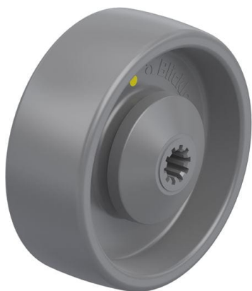
Wheel used PO 100/10KA-ELS