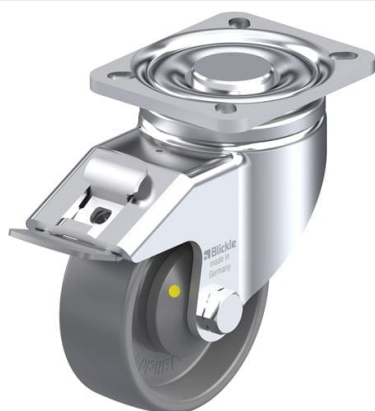
Corresponding standard locking LH-PO 100KA-1-FI-ELS