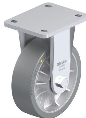
Corresponding rigid caster BO-ALTH 162K-AS