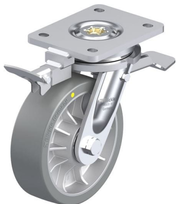
Corresponding standard locking LO-ALTH 162K-ST-AS-RI4