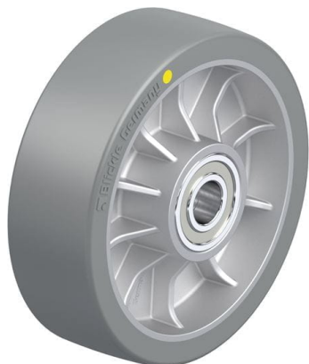
Wheel used ALTH 162/20K-AS