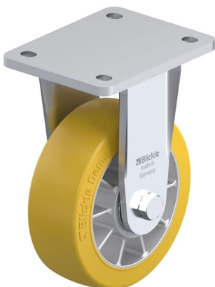
Corresponding rigid caster BO-ALTH 152K