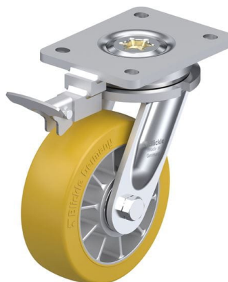
Corresponding swivel caster LO-ALTH 152K-RI4