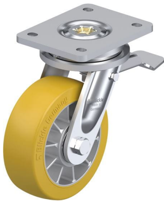
Corresponding standard locking LO-ALTH 152K-ST