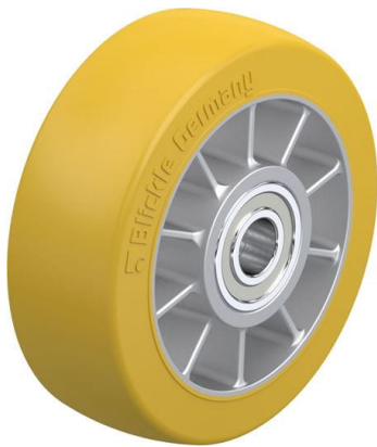
Wheel used ALTH 152/20K