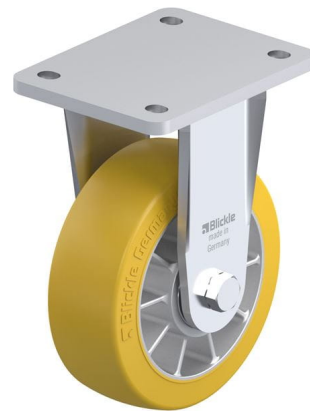
Corresponding rigid caster BO-ALTH 152K