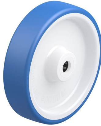
Wheel used POTHS 200/20R