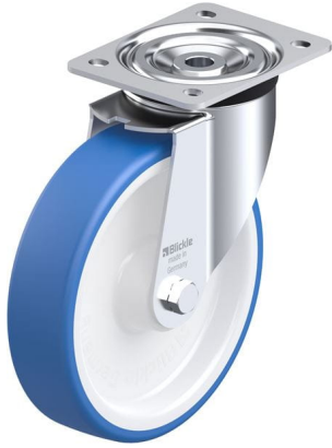
Corresponding swivel caster L-POTHS 200R