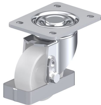
Corresponding swivel caster LH-PO 100G-3-FS