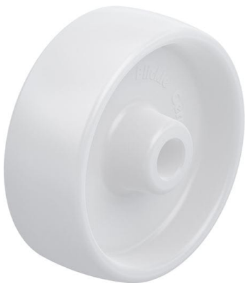
Wheel used PO 100/15G