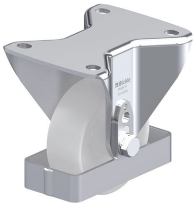
Corresponding rigid caster BH-PO 100G-3-FS