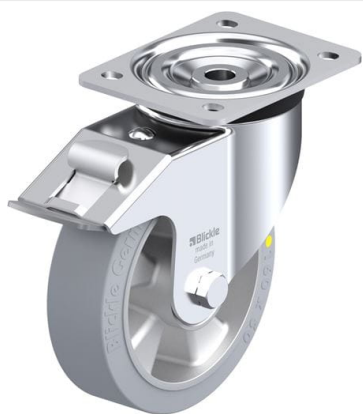
Corresponding standard locking L-ALEV 160K-FI-SG-AS