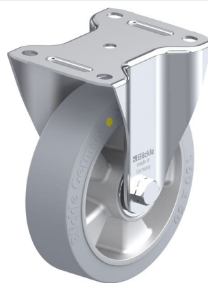
Corresponding rigid caster B-ALEV 160K-SG-AS