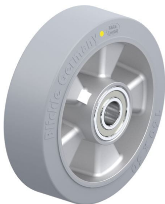
Wheel used ALEV 160/20K-SG-AS