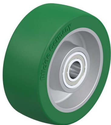
Wheel used ALST 100/15K