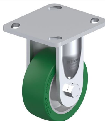
Corresponding rigid caster BHS-ALST 100K-14