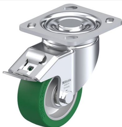
Corresponding standard locking LH-ALST 100K-14-FI