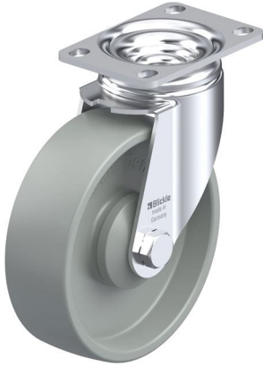
Corresponding swivel caster L-POG 125KA-12