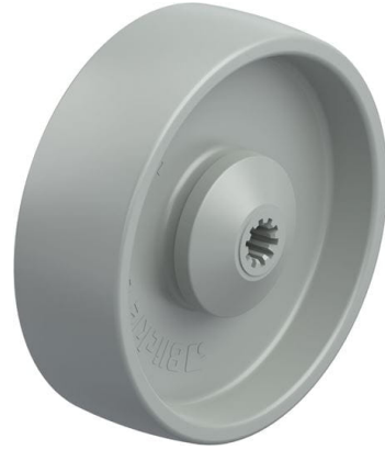
Wheel used POG 125/10KA