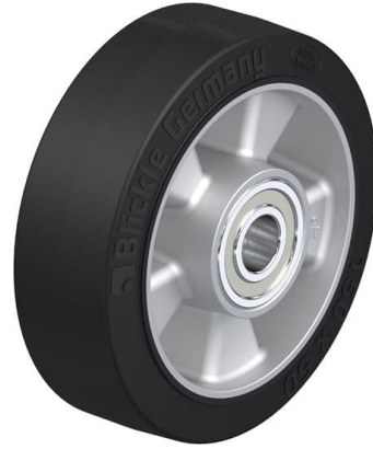
Wheel used ALEV 150/20K