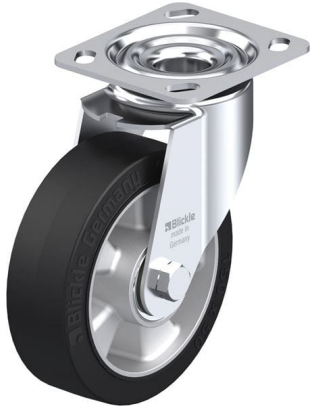
Corresponding swivel caster LE-ALEV 150K-14