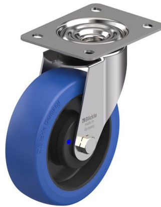
Corresponding swivel caster LEX-POBS 160XKA