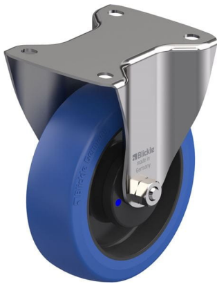
Corresponding rigid caster BX-POBS 160XKA