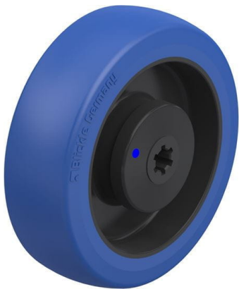
Wheel used POBS 160/12XKA