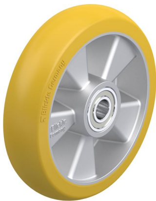
Wheel used ALTH 200/20K-CO