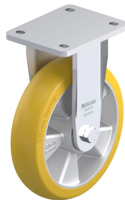
Corresponding rigid caster BO-ALTH 200K-CO