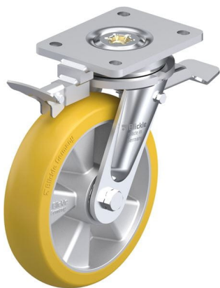
Corresponding standard locking LO-ALTH 200K-ST-CO-RI4