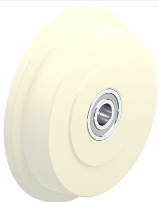
Wheel used SPKGSP0 200K