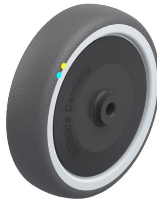
Wheel used PATH 125/8KFD-ELS