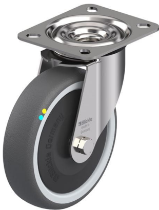
Corresponding swivel caster LEX-PATH 125KFD-ELS