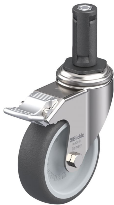
Corresponding standard locking LKRXA-PATH 101G-11-FI-EXR13