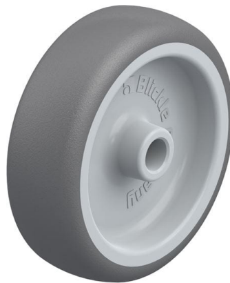
Wheel used PATH 101/12G