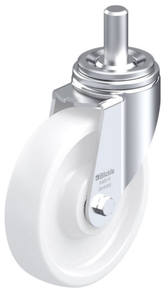
Corresponding swivel caster LHZ-SPO 201K