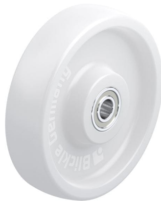
Wheel used SPO 201/20K