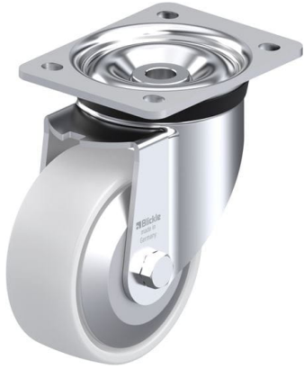
Corresponding swivel caster LK-PO 127R-FA