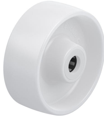
Wheel used PO 127/20R