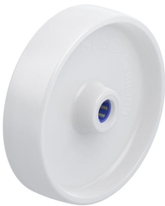
Wheel used PO 200/20XR