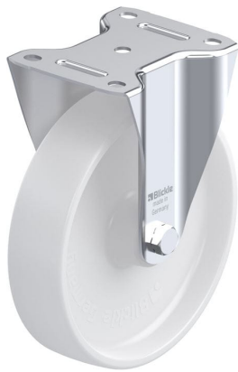
Corresponding rigid caster B-PO 200XR