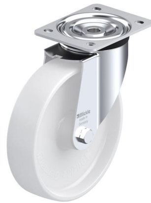
Corresponding swivel caster L-PO 200XR