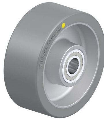
Wheel used ALTH 100/15K-AS