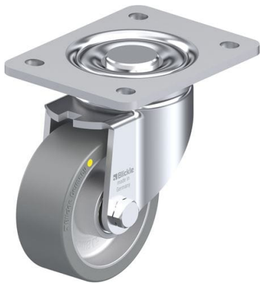
Corresponding swivel caster LH-ALTH 100K-3-AS