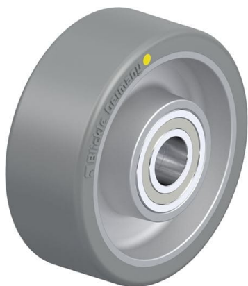
Wheel used ALTH 80/15K-AS