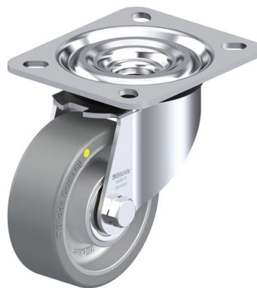
Corresponding swivel caster L-ALTH 80K-AS