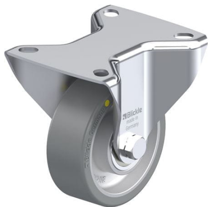
Corresponding rigid caster B-ALTH 80K-AS