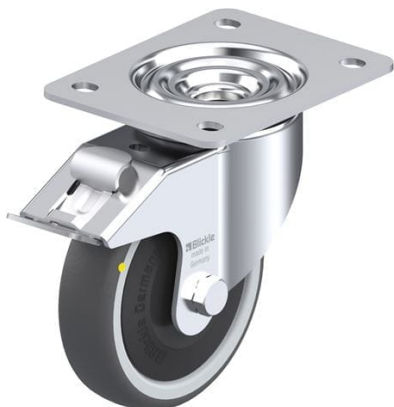
Corresponding standard locking LK-PATH 125KF-3-FI-ELS