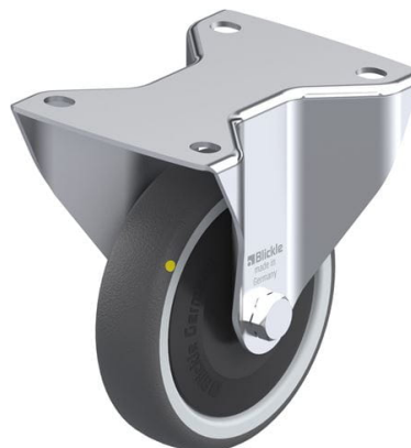
Corresponding rigid caster BK-PATH 125KF-3-ELS