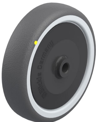
Wheel used PATH 125/10KF-ELS