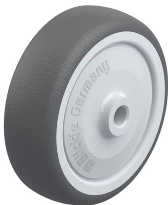
Wheel used PATH 100/10KF