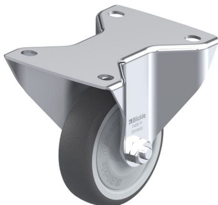
Corresponding rigid caster BK-PATH 100KF-3