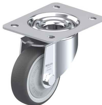
Corresponding swivel caster LK-PATH 100KF-3