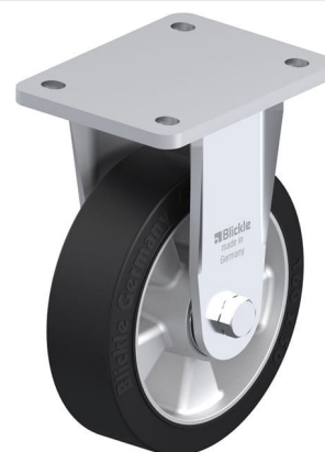
Corresponding rigid caster BO-ALEV 160K