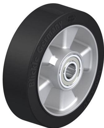
Wheel used ALEV 160/20K