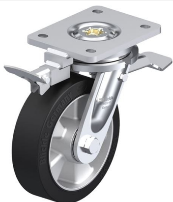
Corresponding standard locking LO-ALEV 160K-ST-RI4