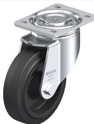
Corresponding swivel caster LH-POEV 160XR