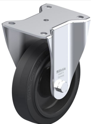
Corresponding rigid caster BH-POEV 160XR