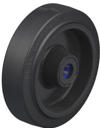
Wheel used POEV 160/20XR