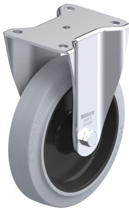
Corresponding rigid caster BH-POEV 200XR-SG