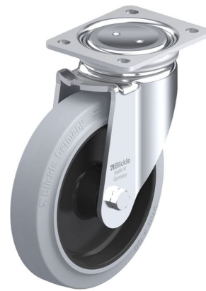
Corresponding swivel caster LUH-POEV 200XR-SG