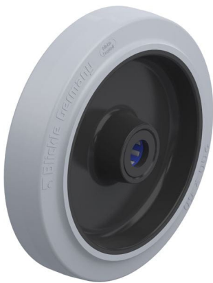
Wheel used POEV 200/20XR-SG