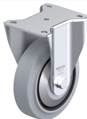
Corresponding rigid caster BH-POEV 160XKA-SG-FA