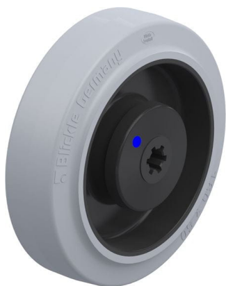
Wheel used POEV 160/12XKA-SG