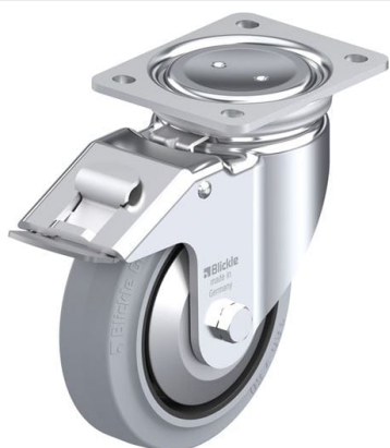
Corresponding standard locking LUH-POEV 160XKA-FI-SG-FA