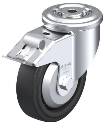
Corresponding standard locking LKR-POEV 125KAD-FI-FA