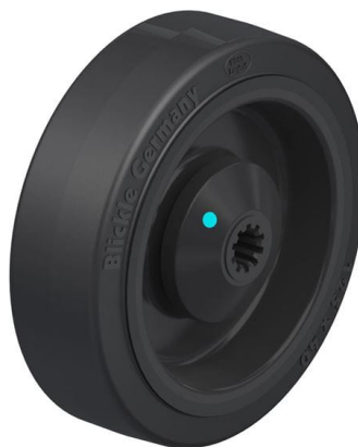
Wheel used POEV 125/10KAD