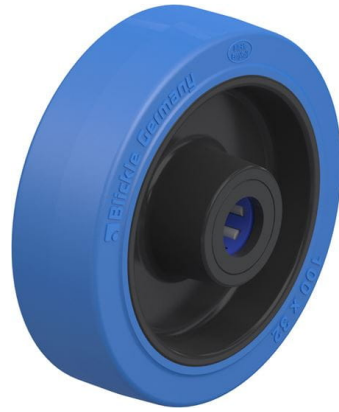
Wheel used POEV 100/15XR-SB