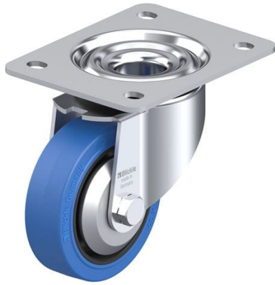
Corresponding swivel caster LK-POEV 100XR-3-SB-FA