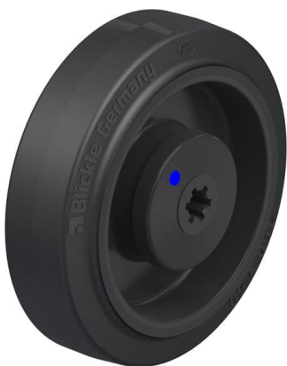
Wheel used POEV 160/12XKA