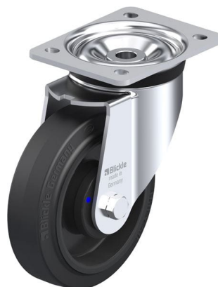
Corresponding swivel caster LK-POEV 160XKA