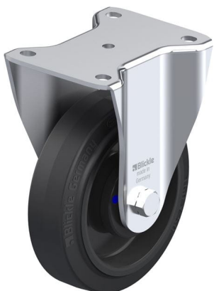
Corresponding rigid caster BH-POEV 160XKA