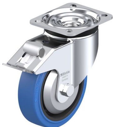
Corresponding standard locking LK-POEV 125KAD-1-FI-SB-FA