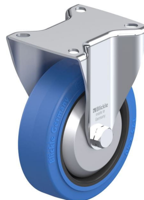
Corresponding rigid caster BK-POEV 125KAD-1-SB-FA