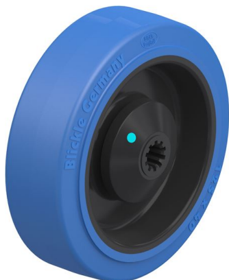
Wheel used POEV 125/10KAD-SB