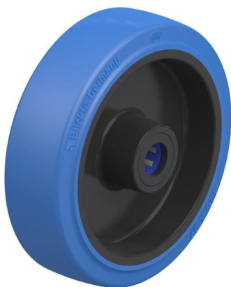
Wheel used POEV 125/15XR-SB