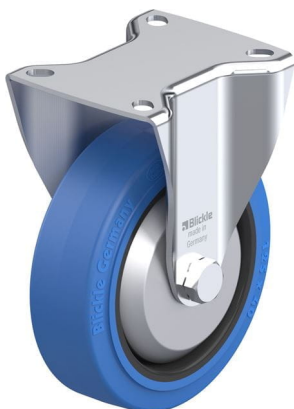
Corresponding rigid caster BK-POEV 125XR-1-SB-FA