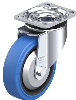
Corresponding swivel caster LK-POEV 125XR-1-SB-FA