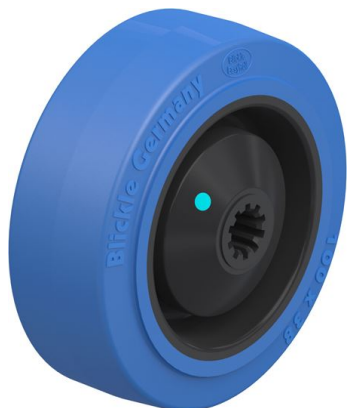
Wheel used POEV 100/10KAD-SB