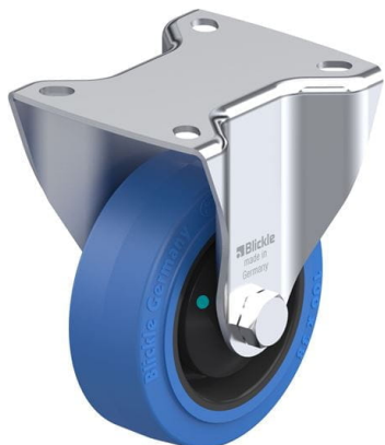
Corresponding rigid caster BK-POEV 100KAD-1-SB