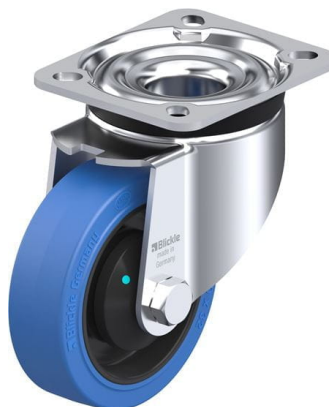
Corresponding swivel caster LK-POEV 100KAD-1-SB