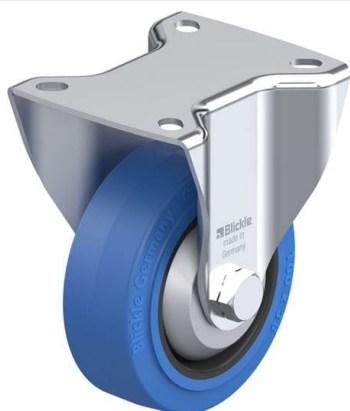
Corresponding rigid caster BK-POEV 100XR-1-SB-FA