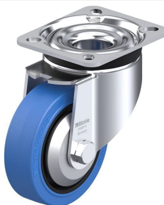
Corresponding swivel caster LK-POEV 100XR-1-SB-FA