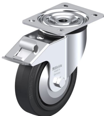
Corresponding standard locking L-POEV 160XKA-FI-FA