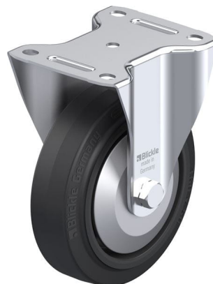
Corresponding rigid caster B-POEV 160XKA-FA