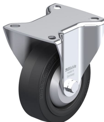
Corresponding rigid caster B-POEV 100KAD-FA