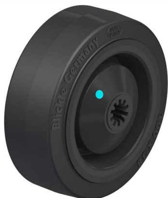
Wheel used POEV 100/8KAD