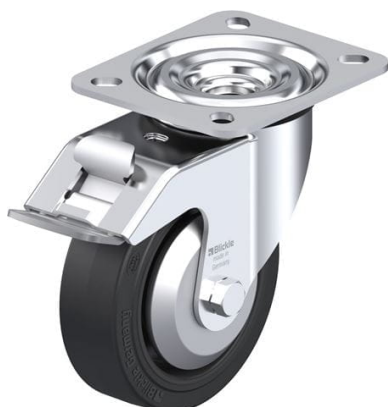
Corresponding standard locking L-POEV 100KAD-FI-FA