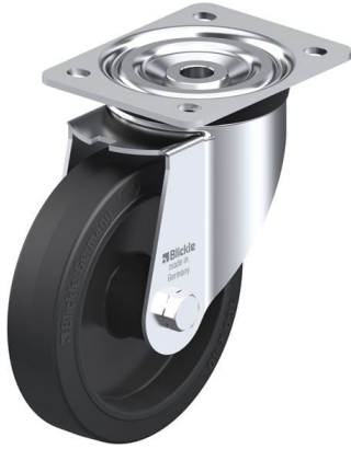
Corresponding swivel caster L-POEV 161XR