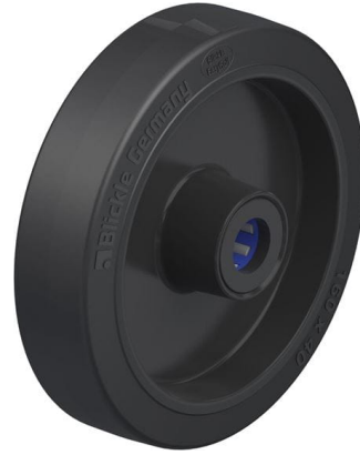
Wheel used POEV 161/20XR