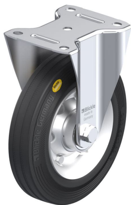
Corresponding rigid caster B-RD 200K