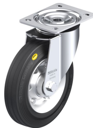
Corresponding swivel caster L-RD 200K