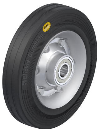
Wheel used RD 200/20K