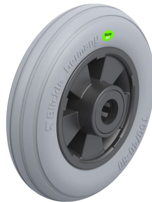
Wheel used VWPP 160/20R-SG