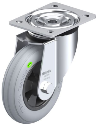
Corresponding swivel caster L-VWPP 160R-SG