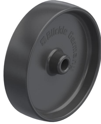
Wheel used POA 125/12G