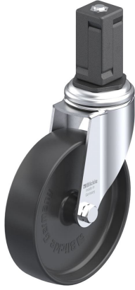
Corresponding swivel caster LKRA-POA 125G-11-EV15