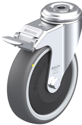
Corresponding standard locking LKRA-PATH 126KF-11-FI-ELS