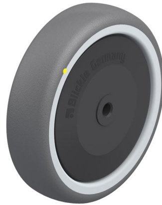
Wheel used PATH 126/8KF-ELS