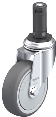
Corresponding swivel caster LKRA-PATH 101KF-11-ER13