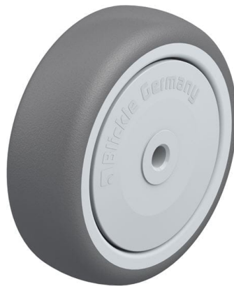
Wheel used PATH 101/8KF