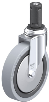
Corresponding swivel caster LKRA-VPA 150G-11-FA-ER14