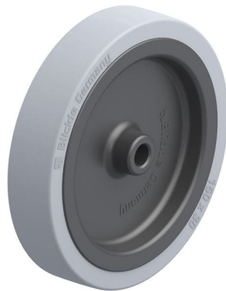
Wheel used VPA 150/12G