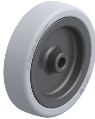
Wheel used VPA 126/12G