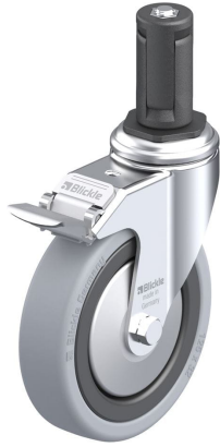
Corresponding standard locking LKRA-VPA 126G-11-FI-FA-ER14