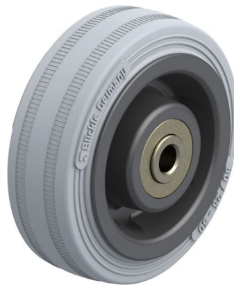
Wheel used VPA 80/8K