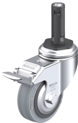
Corresponding standard locking LKRA-VPA 80K-11- FI-FA-ER12